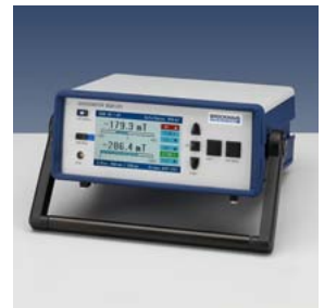
Gaussmeter BGM 201

Measuring Technology for Soft Magnetic Materials Magnetizing Technology Services