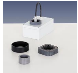
Ring core sensor