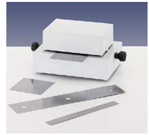
Strip measuring sensor