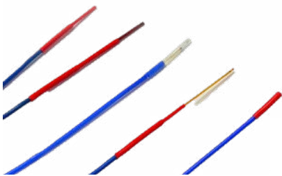
TS2P, TS3, TS4, TS5, TST

Contact us and get support with the product selection.